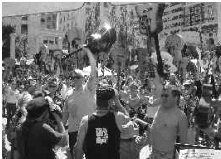
Guitars Up! Guinness World Record breaking world's largest guitar jam hams it up for Sisters.